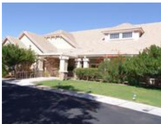
Emeritus at Tucson, 2650 W. Ina Road